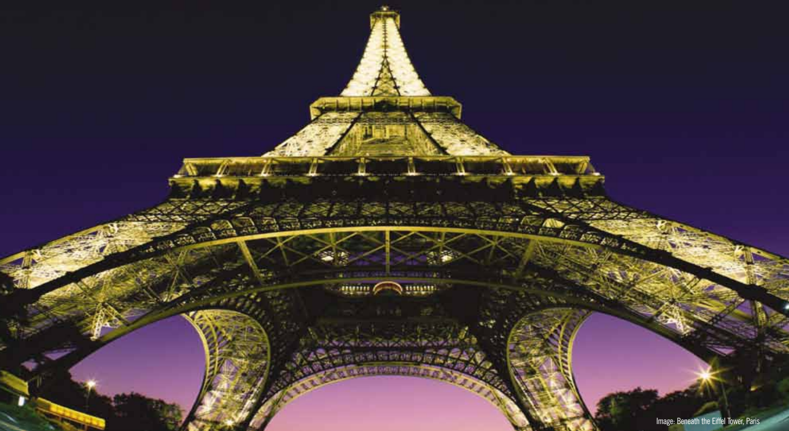
Image: Beneath the Eiffel Tower, Paris

TOURS 2010 BARCELONA TO NIMES SEPTEMBER 2010 20 DAYS ♦ $7,200 per person*